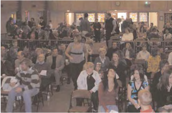
235 people gathered for the first Sunday of CROSSROADS .