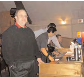
Above are some of the many leaders who have put in many hours of preparation, learning, rehearsing, and praying to make CROSSROADS the success that it is.